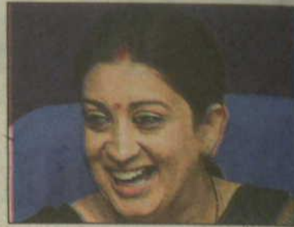
■ Smriti Irani

A sub-committee of the National Institutes of Technology (NIT) council had recommended that Class 12 board marks should